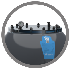
Cover in transparent methacrylate of 25mm thickness high mechanical & chemical resistance

Designed with a large flat protruding surface to support various dimensions of valve kits and threads.