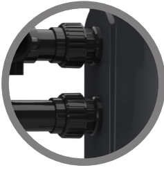
Large robust unions in black High Impact ABS

Optional drain valve kit with hose spigot 25mm.