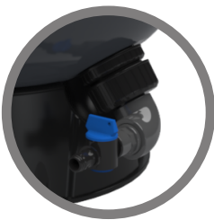
Largest drain on the market with optional drain valve kit

Optional drain valve kit with hose spigot 25mm.